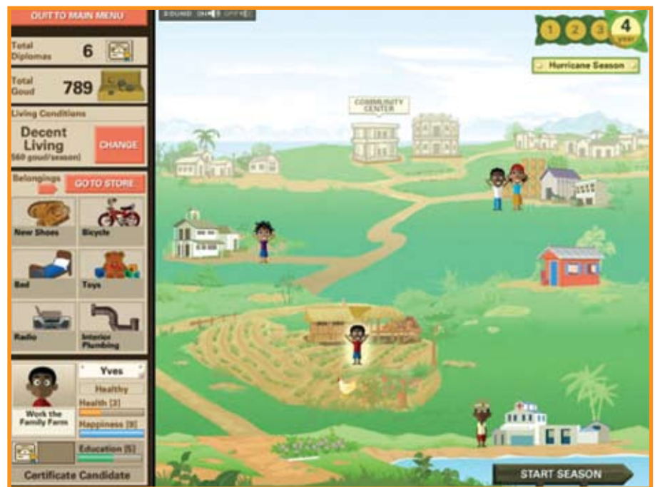
Ayiti: The Cost of Life focuses on the issue of poverty as an obstacle to education and uses the country of Haiti as a case study.